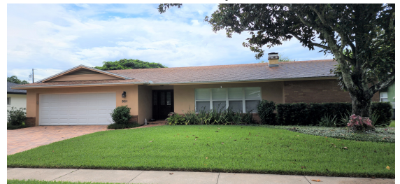
3rd Place - Kim Daly 521 Friar Road