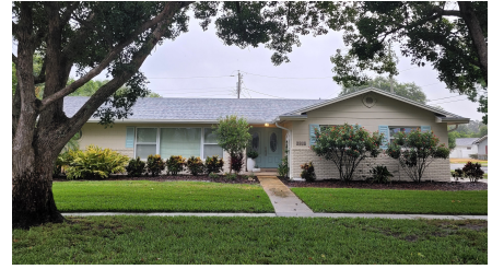
2nd Place -Paul Lemieux 2859 Banchory Road