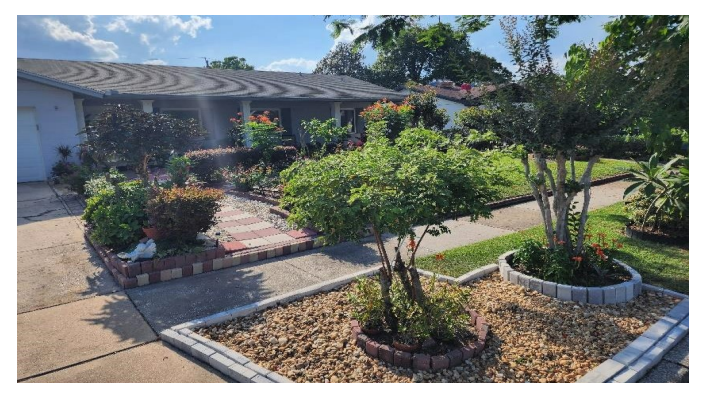
1st Place - Zeny and Larry Schmidt 431 London Road