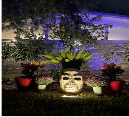
2nd Place - 412 Friar Road Brent & Kim Ludlow