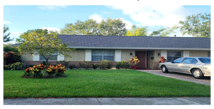
3rd Place - Bettie Wailes 2914 Banchory Rd