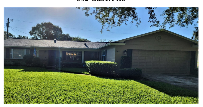
3rd Place -Janet Womble 642 Cornwall Rd