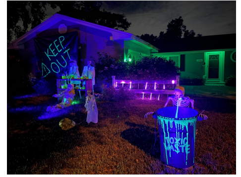
3rd Place -Darren Weiser 2745 Will o' Th Green Street