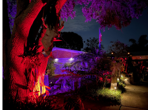
2nd Place - Brent & Kim Ludlow 412 Friar Road