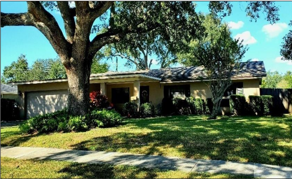
1st place – Melissa Barker 2741 Scarlet Road