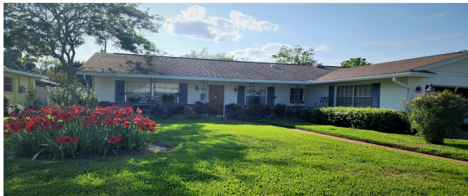
2nd Place - Anthony and Nancy Cervone 501 London Road